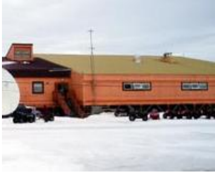
Kwethluk, Ket'acik/Aapalluk Memorial School Gym