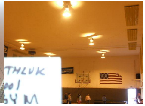
Former 400w HID Lighting, 5 - 10 Ave foot candles and CRI of 30 - 40