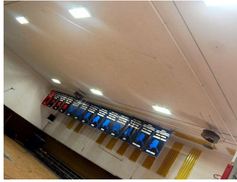
New T5 Fluorescent Lighting, 27 – 30 Ave foot candles and CRI of 85