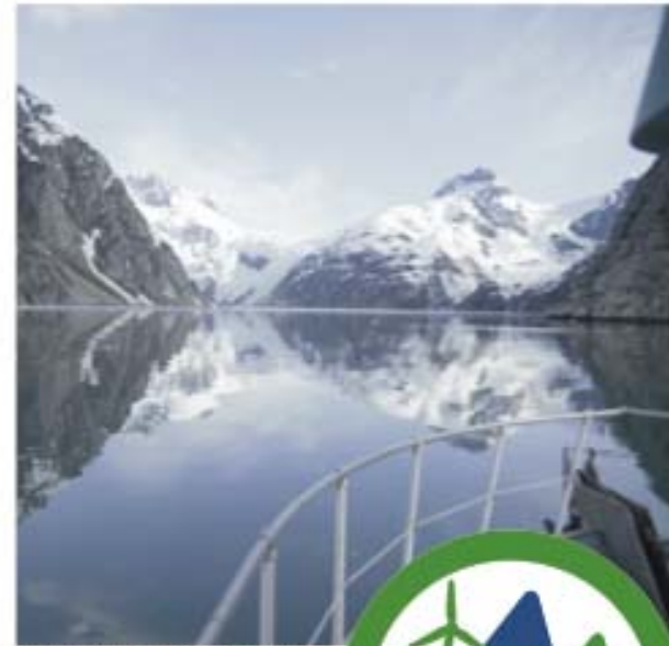
Northwestern Fjord in Kenai Fjords National Park